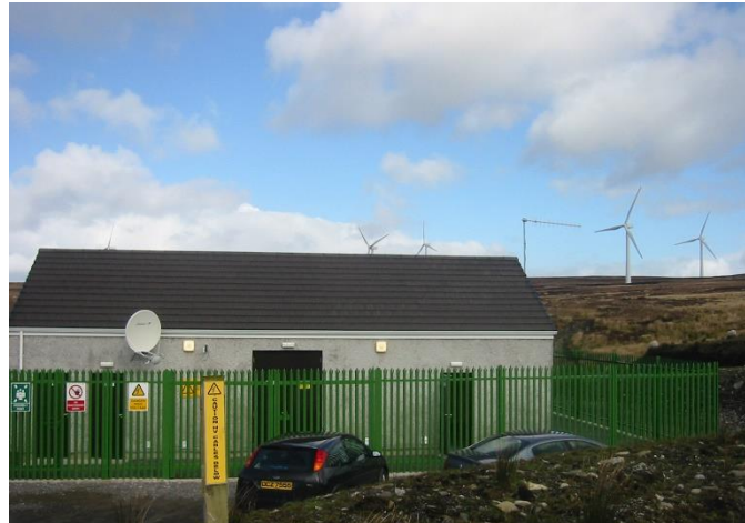
Substation connecting wind farm into an electricity distribution network showing multiple terrestrial UHF and satellite radio links to monitor and control the associated switchgear.

Many of these new power sources are renewable – wind and solar being the most common - but these supplies are intermittent and often unpredictable. As we target a zero-carbon economy, transport and home heating are being converted to electricity, creating large new demands on electricity networks.