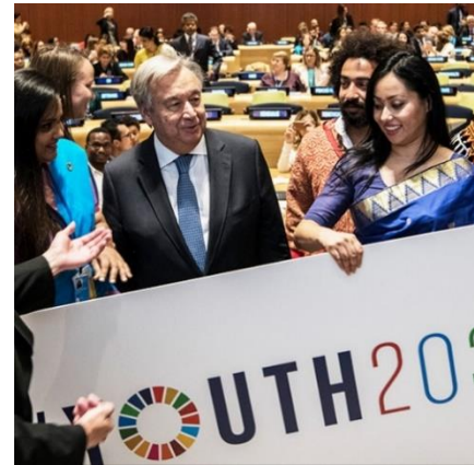
Secretary-General António Guterres speaks with youth attendees at high-level event on Youth2030 in September 2018.

Following the Summit, several European nations committed to some form of net zero carbon emissions by 2050. The EU itself has identified preventing dangerous climate change as a key priority for the European Union. Europe is working hard to cut its greenhouse gas emissions substantially while encouraging other nations and regions to do likewise.