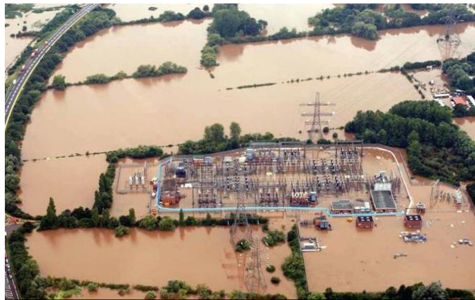
The Walham electricity substation inundated during the 2013 winter floods in the UK

The focus of this response has been to highlight the role that radio can play in assisting utilities to reduce carbon emissions that contribute to climate change, but it is important not to forget the impact that climate change is already having on utility operations, and the role that utilities must play in helping citizens survive the damaging effects already being experienced.