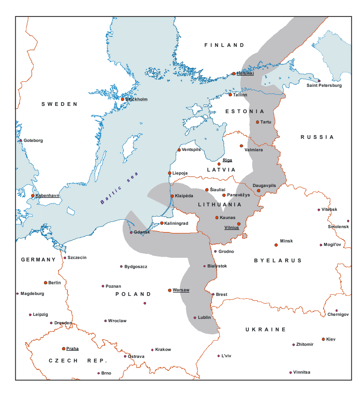
Buffering zone necessary to protect fixed-satellite service of Russia and Belarus in the 3.4-3.6 GHz band