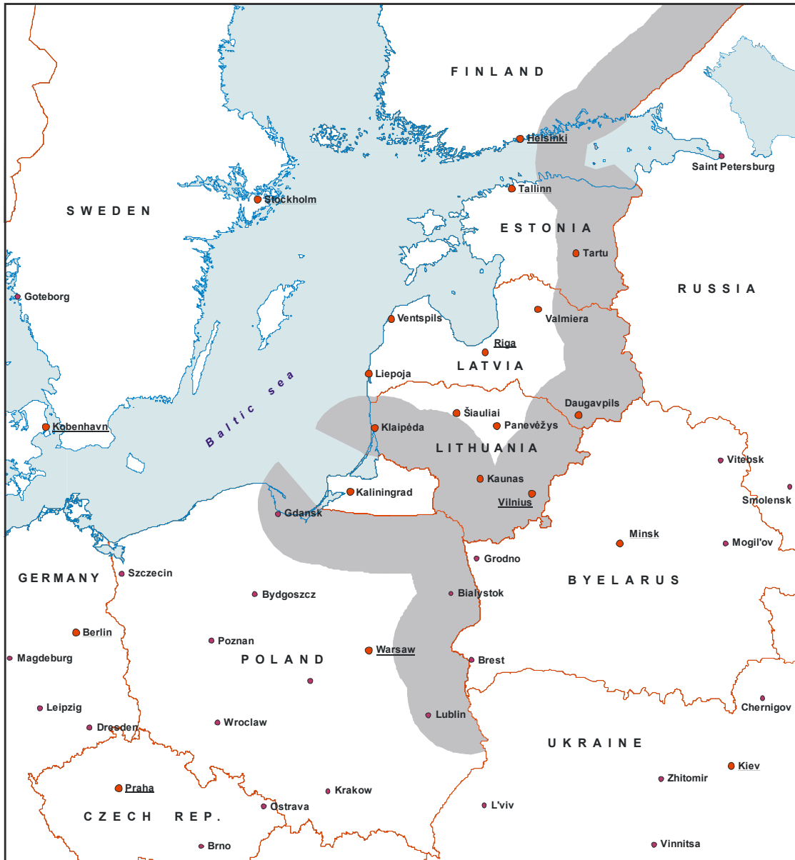
Buffering zone necessary to protect fixed-satellite service of Russia and Belarus in the 3.4-3.6 GHz band